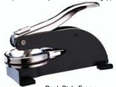
Desk Style Frame

When you use a seal to emboss a document, you are performing a traditional act. Your embossed seal guarantees permanent tamper-proof protection of both your seal and the copy over which it is placed. Our most popular embossing seal is the Ideal® Deluxe Series Model MD. This precision pocket seal embosses your NAME, TITLE and NEW HAMPSHIRE crisply on the document. Your seal can also be provided in a modern heavy duty steel desk frame.