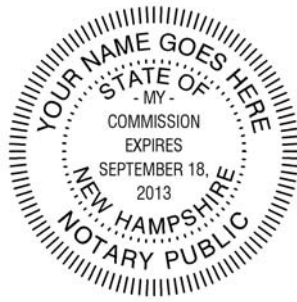
Style NH1 Stamp