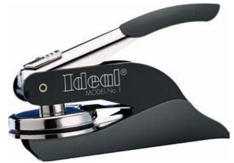
Pocket Style Frame (Shown with optional soft cushion grip)