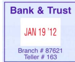
3550 Full Die Plate Die Plate Size 1 1/4" x 1 1/2"