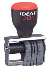
Local Style Dater

*Special locking grooves on the back of the date and number band mechanism provide a sure positioning system for accurate band alignment.