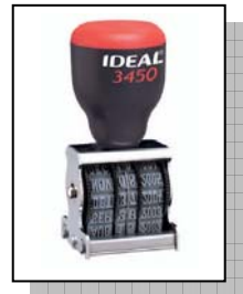
3450 Double Bridge Die Plate Size 5/16" x 1 1/4"